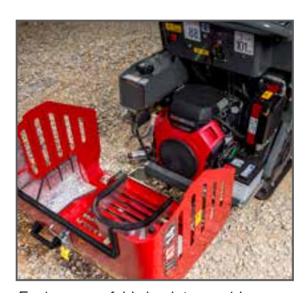
Engine cover folds back to provide convenient access to the engine, gasoline tank, battery, and filters.