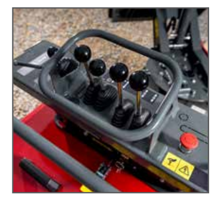
Two servo levers control the direction of the machine, and they automatically reset to stop in case of emergency.