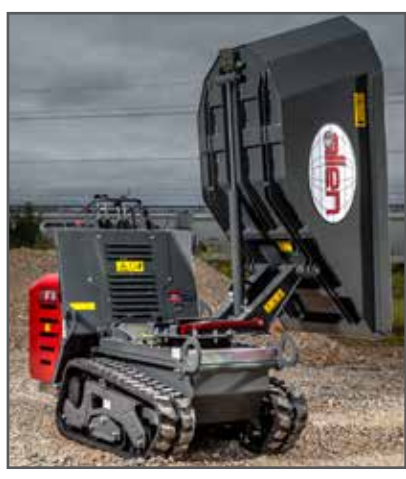
Swivel design allows bucket to turn 90° in either direction from center.